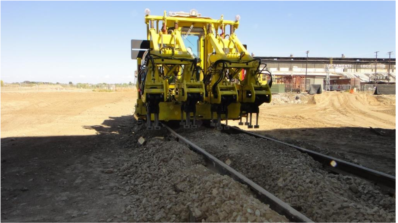
Bring in the tamper