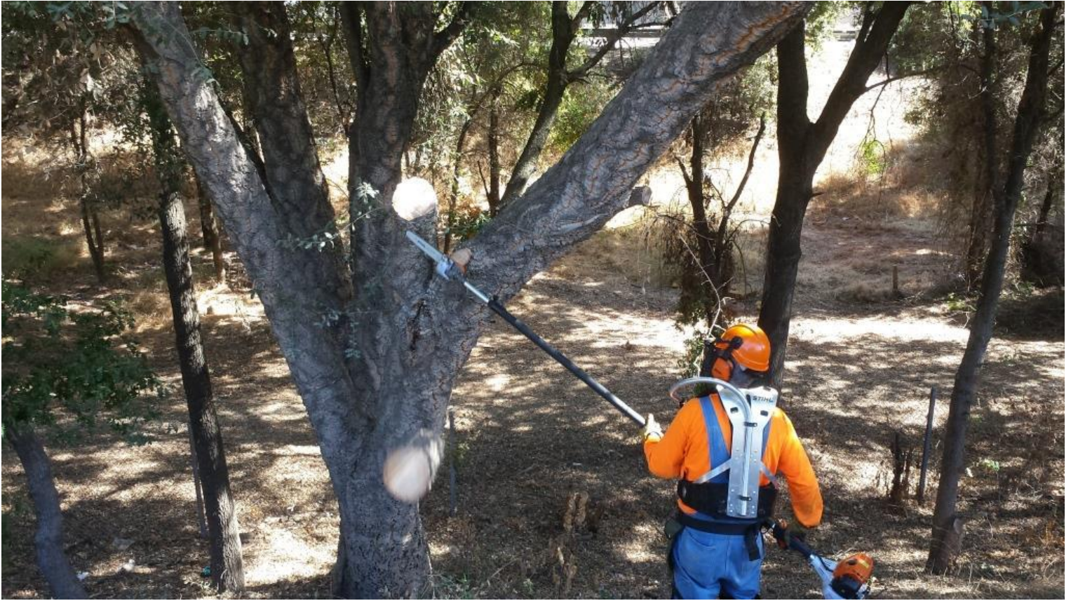
The moment of truth: an offending limb drops after being sliced and diced by Dave's "Ginsu saw" ...