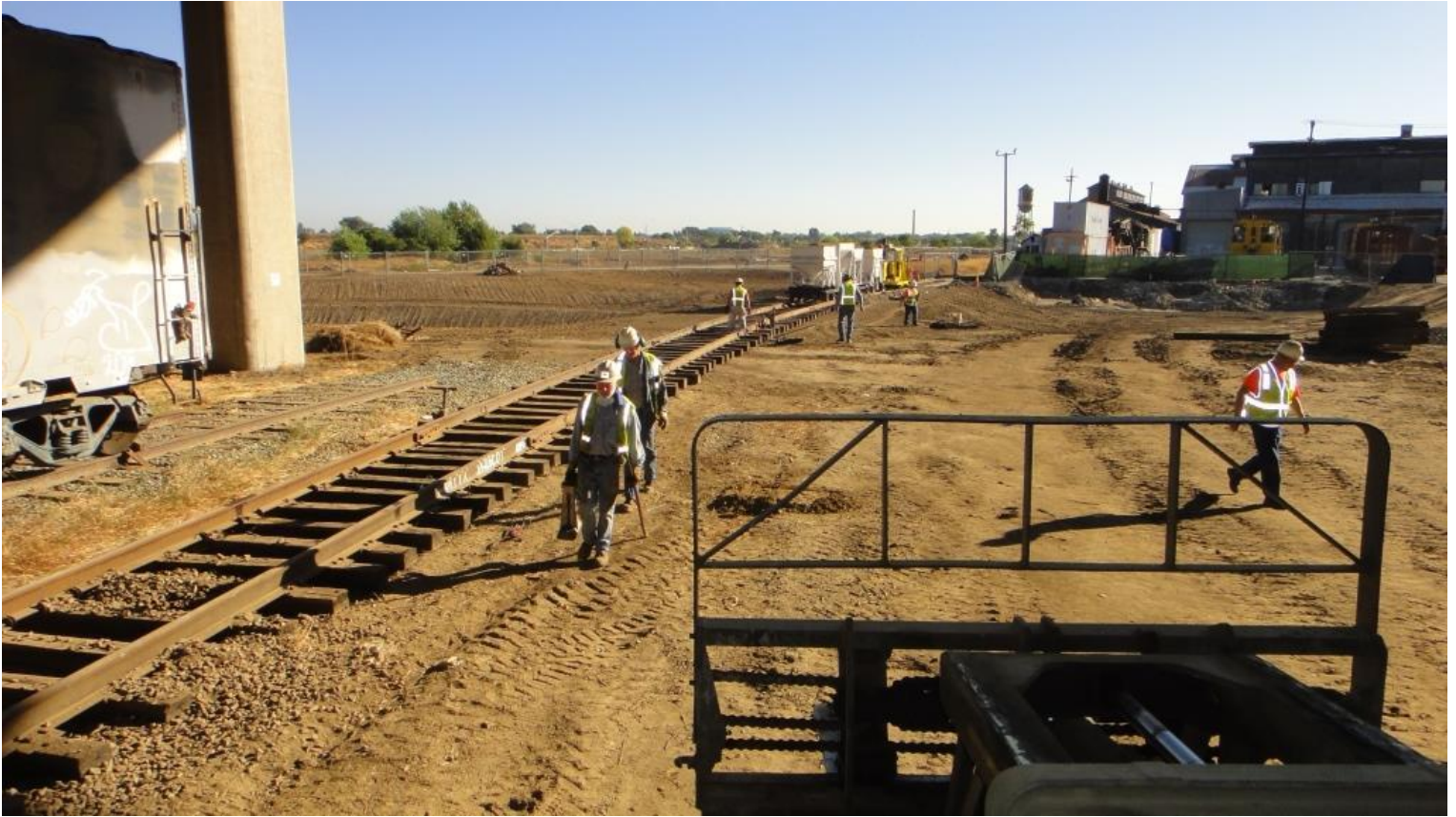
The Team arrives on site