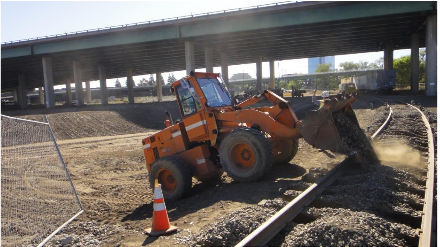
With hopper cars abandoned, Steve in the loader takes an e-ticket ride down into a pit and back up again to ballast the track