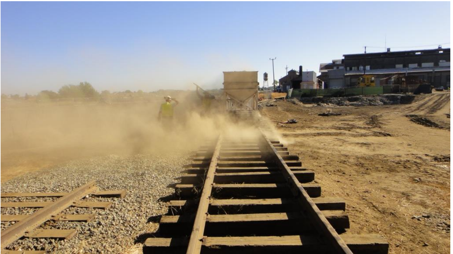
Somethin' ain't right here. The first sign of trouble as a load of rock – er, dirt – is dropped from the ballast hoppers